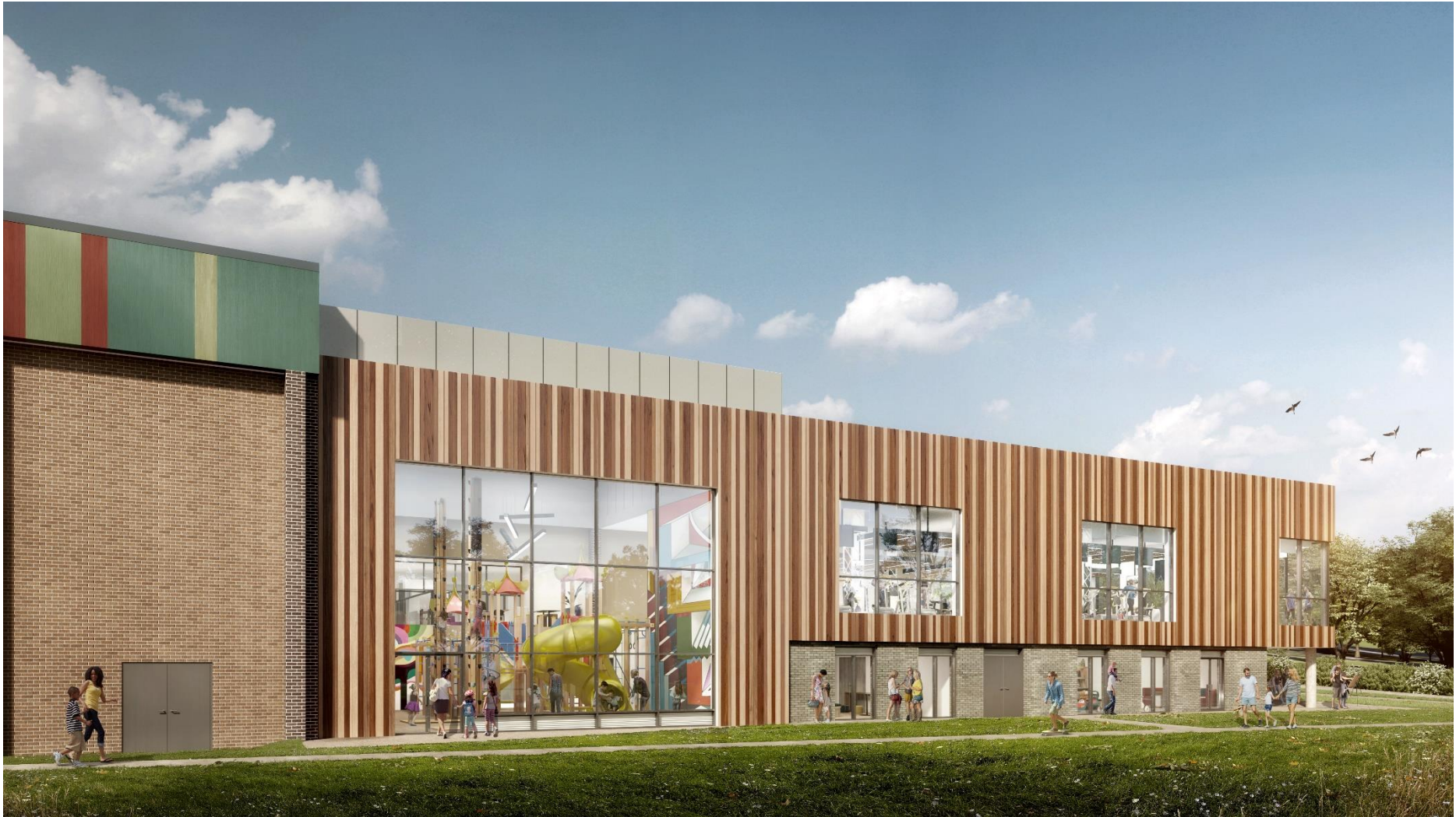
Illustrative elevation – South facing looking out on to Colenso Road