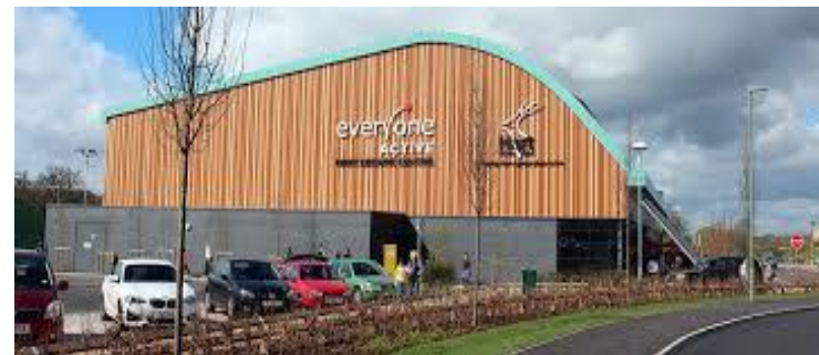
An example of the cladding being used on Hart Leisure Centre

The intention is to have the upper level of the extension cantilever beyond the existing line of the leisure centre. This will create a feature corner for the scheme. This is subject to the Structural Engineers input in the following work stages.