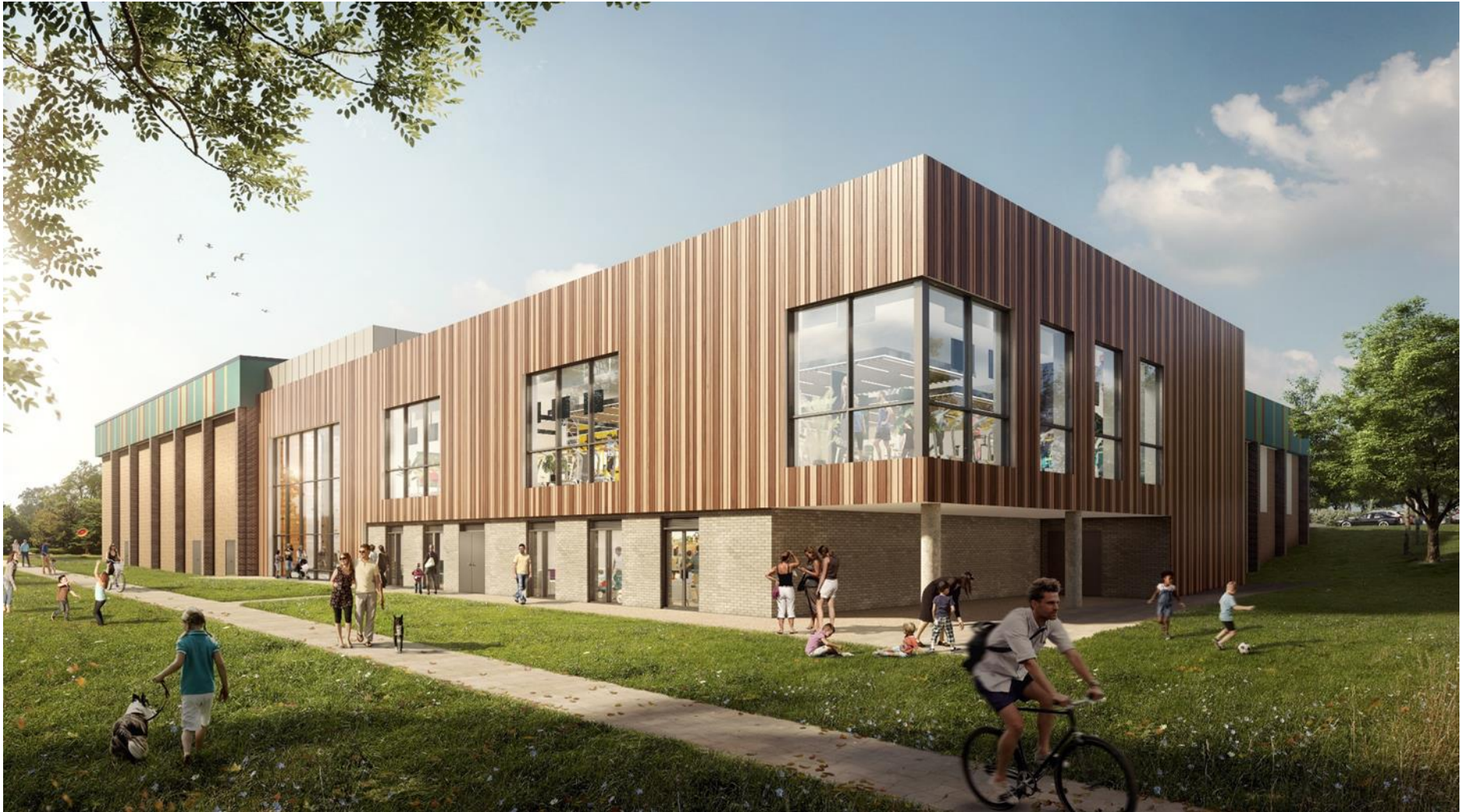
Illustrative elevation - South-East corner looking out on to Park Lane and Colenso Road